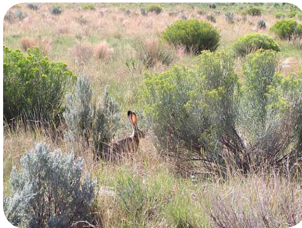
Wheatgrasses, sage bush, pinyon and juniper are part of an ET cover at the Monticello Mill Tailings Superfund site in Utah.

ET covers can be a quick, relatively inexpensive way to isolate landfill wastes and other buried contaminated materials. Like conventional caps, installing an ET cover can avoid the excavation of large amounts of soil or waste having low levels of contamination. ET covers can be designed to provide equal performance to conventional caps, and the plants can make the site more attractive. They are also less likely than conventional caps to be damaged by repeated freezing and thawing as seasons change. ET covers are more commonly used in dry climates where there is little rainfall.