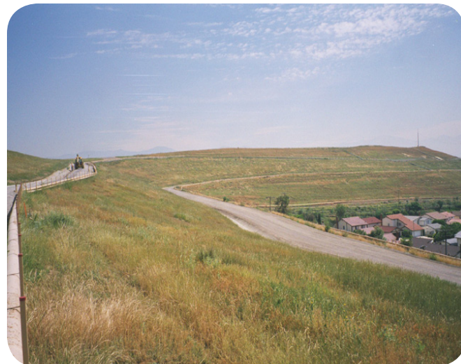
Example of ET cover used at Operating Industries, Inc. Landfill Superfund site.

Like other caps, ET covers do not destroy or remove contaminants. Instead, they isolate them and keep them in place to prevent the spread of contamination and protect people and wildlife from the contaminated material. ET covers are constructed by placing a 2- to 10-foot-thick layer of fine-grained soil containing silt and clay over the contaminated material. The type of soil is chosen for its ability to store water and promote plant growth. The thickness of the cover depends on how much rainfall and snowmelt is expected in the area. Grass, shrubs, or small trees that form extensive